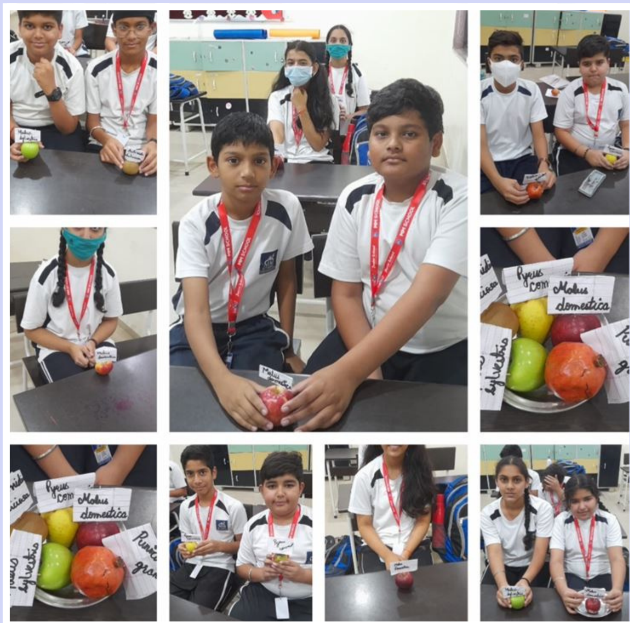
Grade 8 Experiential Learning Botanical Nomenclature of fruits ( Biodiversity )