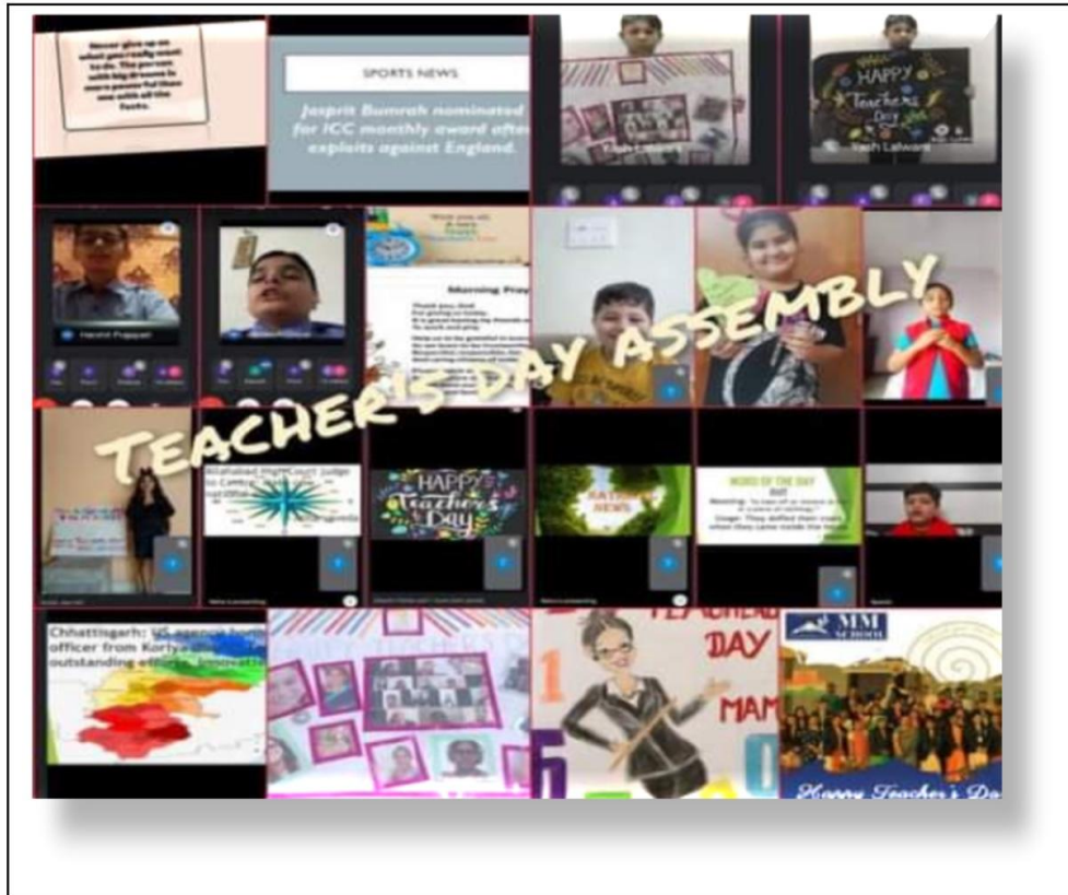
TEACHERS DAY ASSEMBLY

The students of MM school gave tribute to their teacher's on 07 th September 2021 by celebrating teachers day in which students gave speech, danced and sang different songs for their teachers and performed skits to dedicate to their teachers.