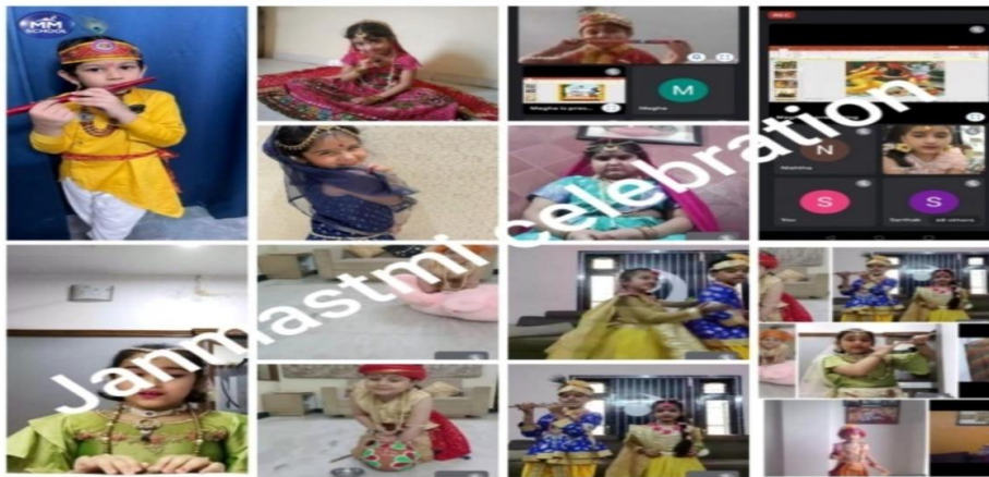
Grade I to V celebrate Janmasti with great enthusiasm they all participated with great zeal